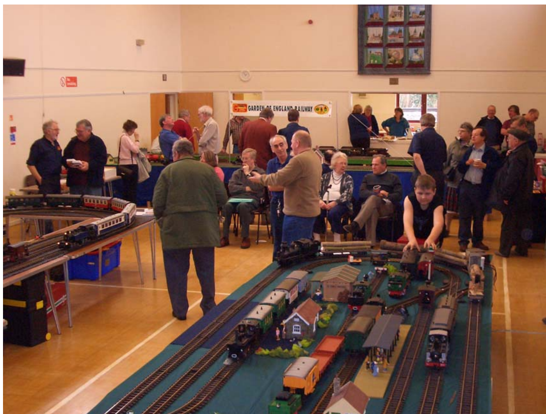
A picture of last year's popular event to whet your appetite!

There is no admission charge, but donations towards refreshments and hall hire will be collected and there will be a raffle. Once expenses have been met, any profit will go into the Surrey G Scale account to cover the next indoor meet and expenses such as postage.